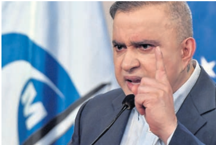
Venezuelan Attorney General Tarek William Saab speaks during a news conference about corruption cases with the state run oil company, PDVSA, in Caracas, Venezuela, Saturday, March 25, 2023. Saab said Saturday that 21 people, including senior officials in the government of President Nicolás Maduro and business leaders, have been arrested in connection with a corruption scheme involving international oil sales.

The attorney general's statement comes five days after Venezuela's once-